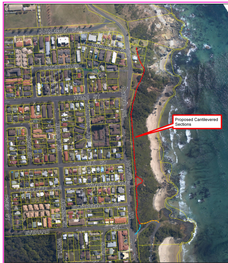
Proposed walkway route adjacent to Pacific Drive in Port Macquarie